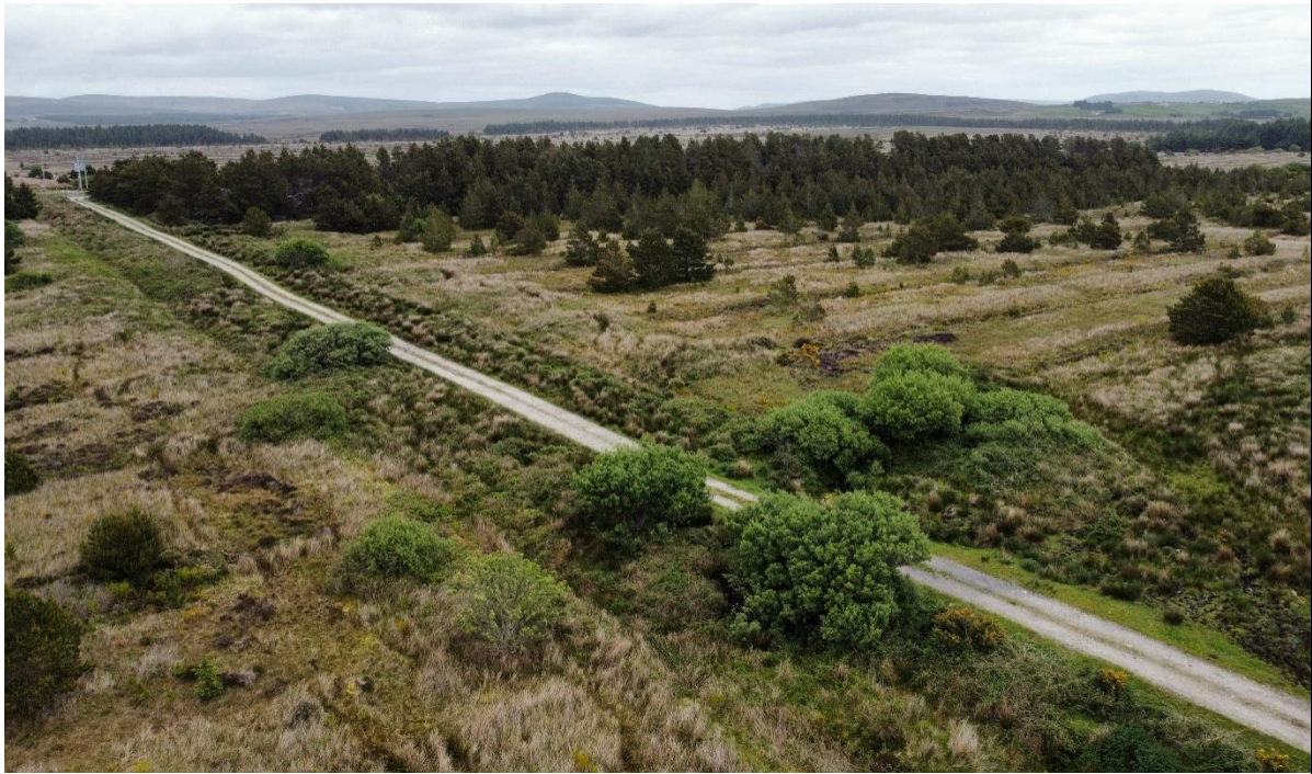
Description: Photo shows an existing access road and location of the proposed turbine T5, looking north