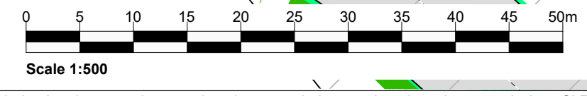
Figure Number D05-3 Rev P02

I:\AT\local\offices\IE\Dublin\SLR_DAV\SLR_Projects\06571_RWE_Renewables_Ireland\065301_00001_D05-3_Proposed_Turbine_No_3.dwg 14/04/2026