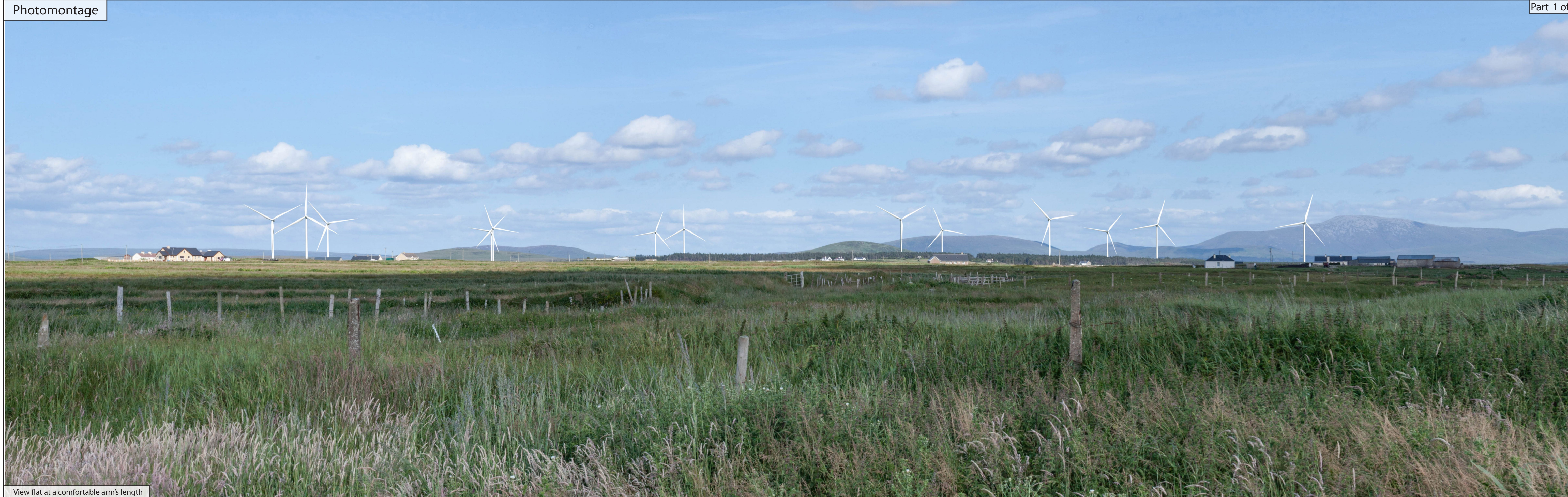
View flat at a comfortable arm's length

This planar projection panorama has been captured, prepared and presented in accordance with the guidance set out in the Scottish Natural Heritage 2017 guidance 'Visual Representation of Wind Farms'.